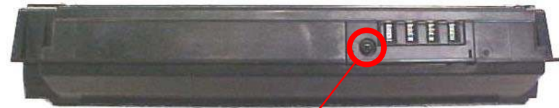
Remove screw to replace chip